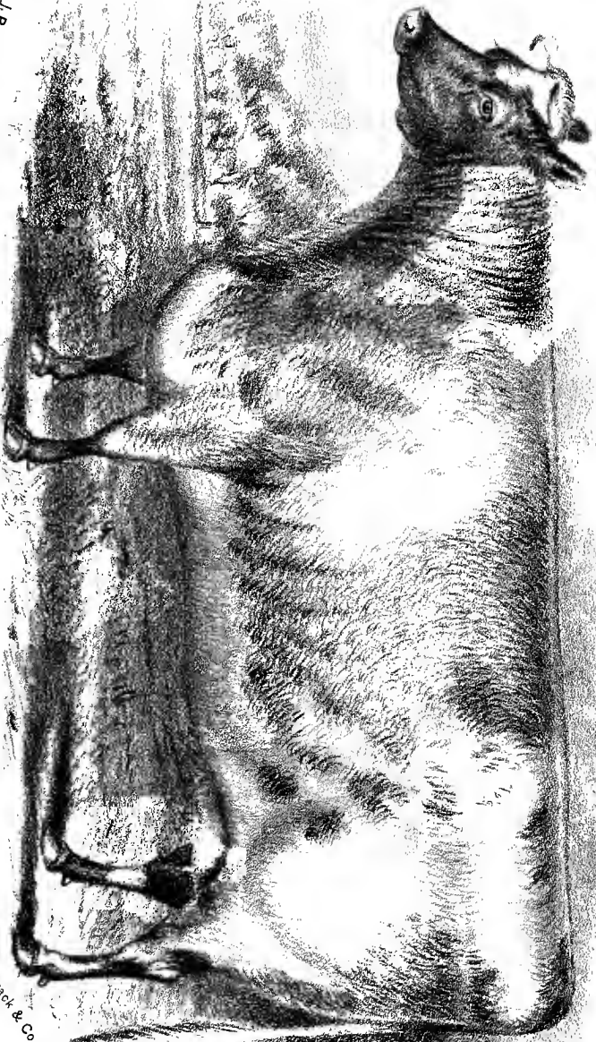
10th DUCHESS OF GENEVA. At 5 Years.